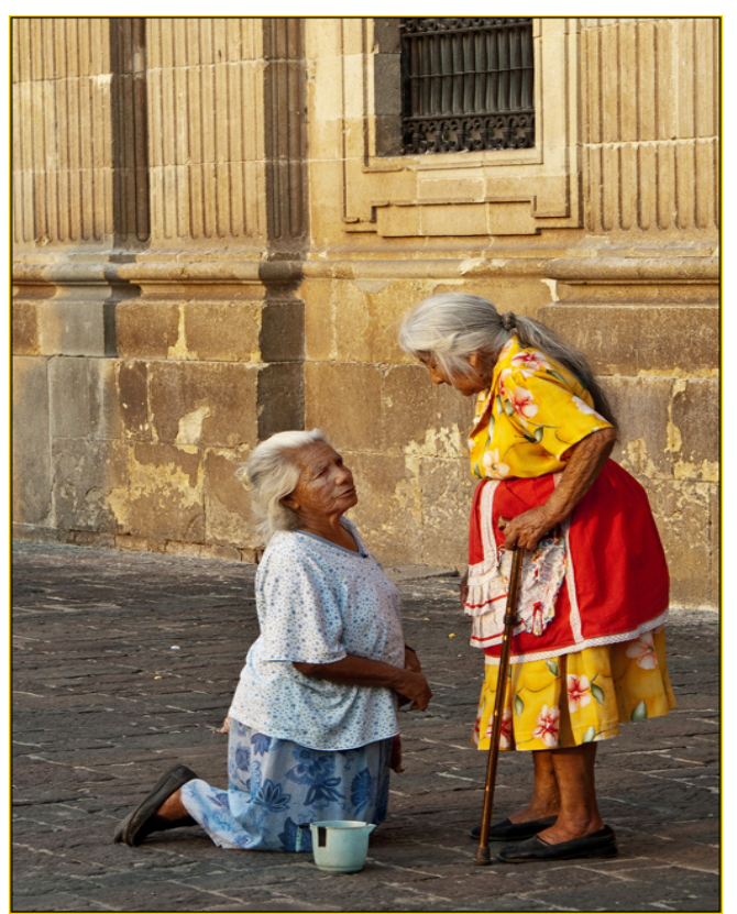
"Old Woman and the Beggar" by Tim Starr